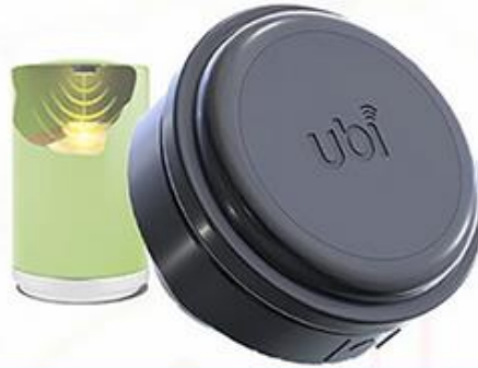
Ultrasonic Level Sensor (UBi)