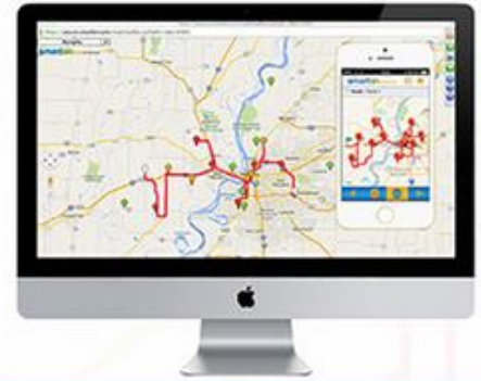
Route Optimization - SmartBin Live